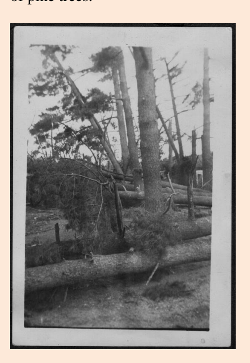
1938 Hurricane Damage Pine Grove Cemetery

The Great Hurricane of 1938 which brought havoc in Boylston on 21 September 1938 also affected Pine Grove Cemetery. The hearse house was crushed, many tombstones were shattered by the falling trees, and the hurricane destroyed the pine trees lining the avenue to the cemetery. For more information on the Great Hurricane of 1938, please read the Friday's Fascinating Finds article Boylston, a Maze of Trees by Carrie Crane FFF09092022 Boylston, A Maze of trees.pdf (boylstonhistory.org) Below are some photographs of the damage caused by the hurricane to the cemetery and the avenue of pine trees.