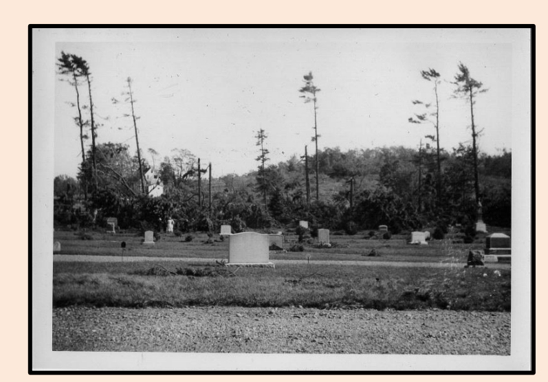
View of Pine Grove Cemetery

After September 21, 1938 BHSM Photograph Collection