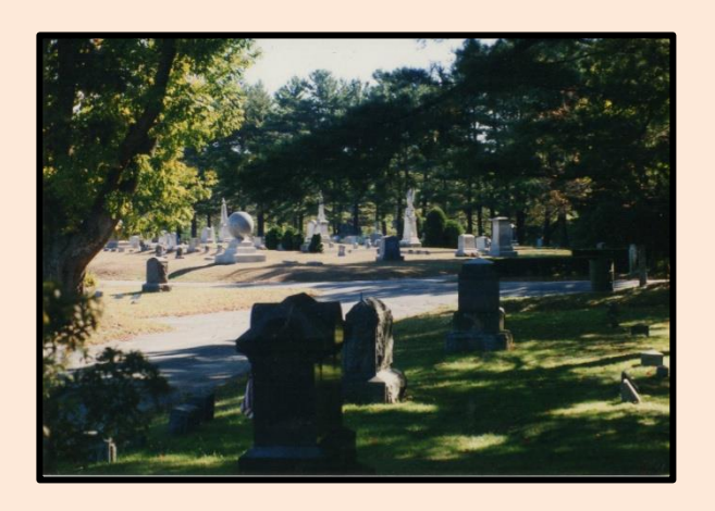
View of Pine Grove Cemetery

"The trees were all blown down. A new and wider drive has been completed, but no trees, only at the right of new driveway. This is written on February 28, 1940."