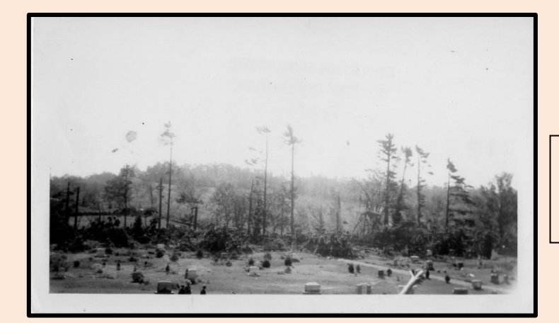
View of Pine Grove Cemetery After September 21, 1938 BHSM Photograph Collection