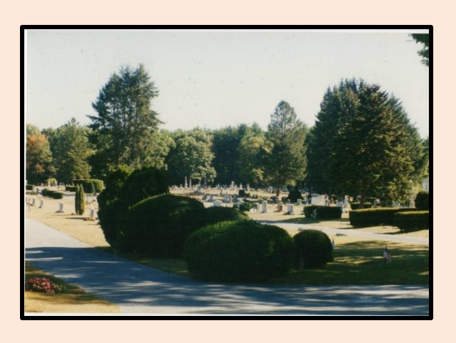
View of Pine Grove Cemetery